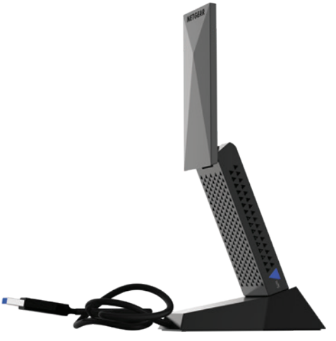
Magnetic cradle included