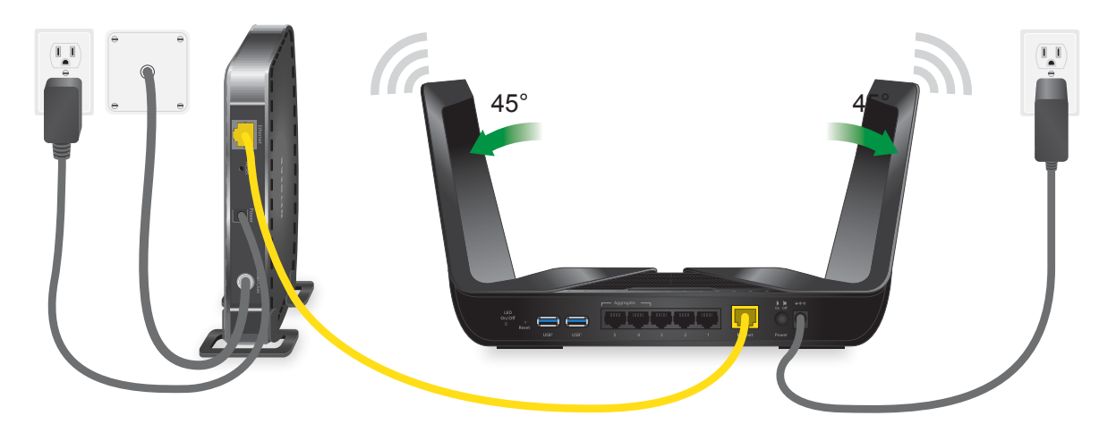
Figure 6. Cable your router

Power on your router and connect it to a modem.