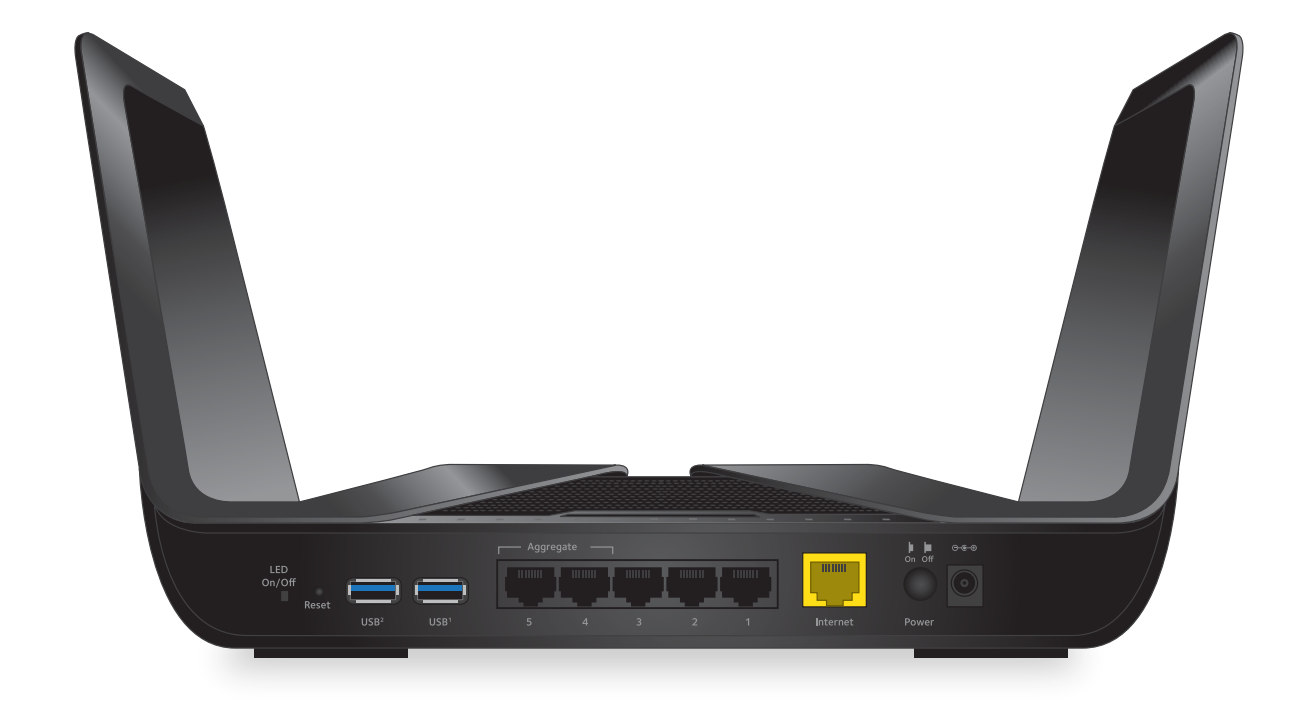
Figure 3. Rear panel

The following figure shows the rear panel connectors and buttons.