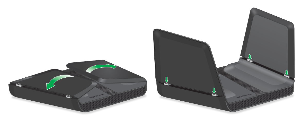
Figure 4. Position the antennas

Before you install your router, extend the antennas as shown in the following figure.