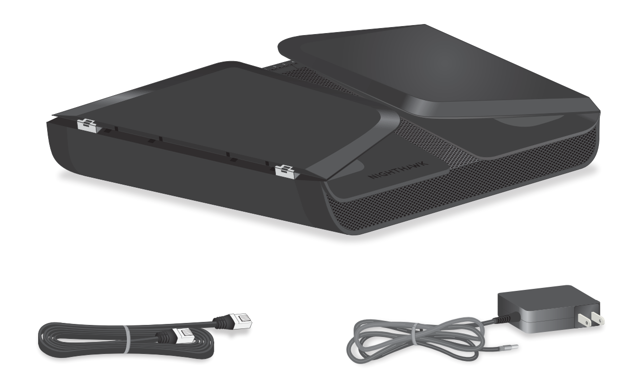
Figure 1. Package contents

Your package contains the router, the power adapter, and an Ethernet cable.