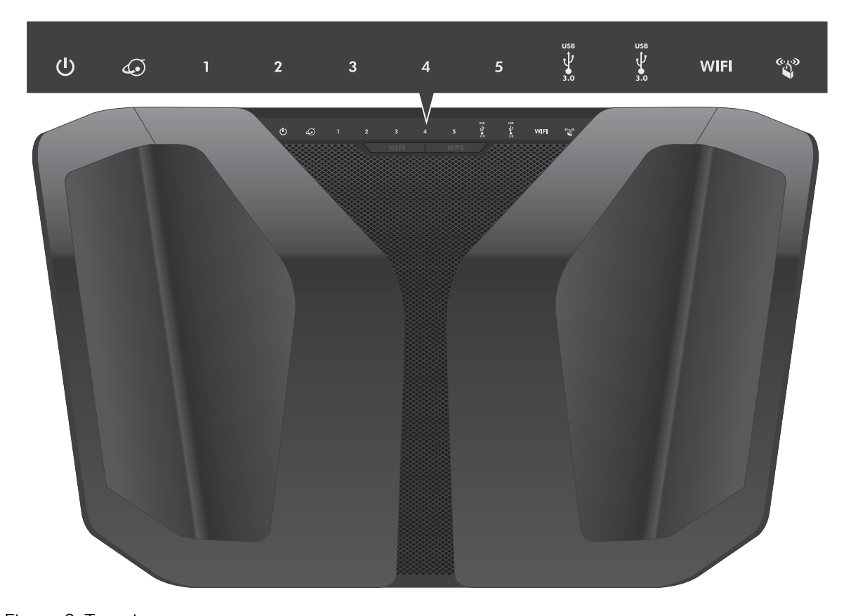
Figure 2. Top view

The status LEDs and two buttons are located on the top panel of the router.